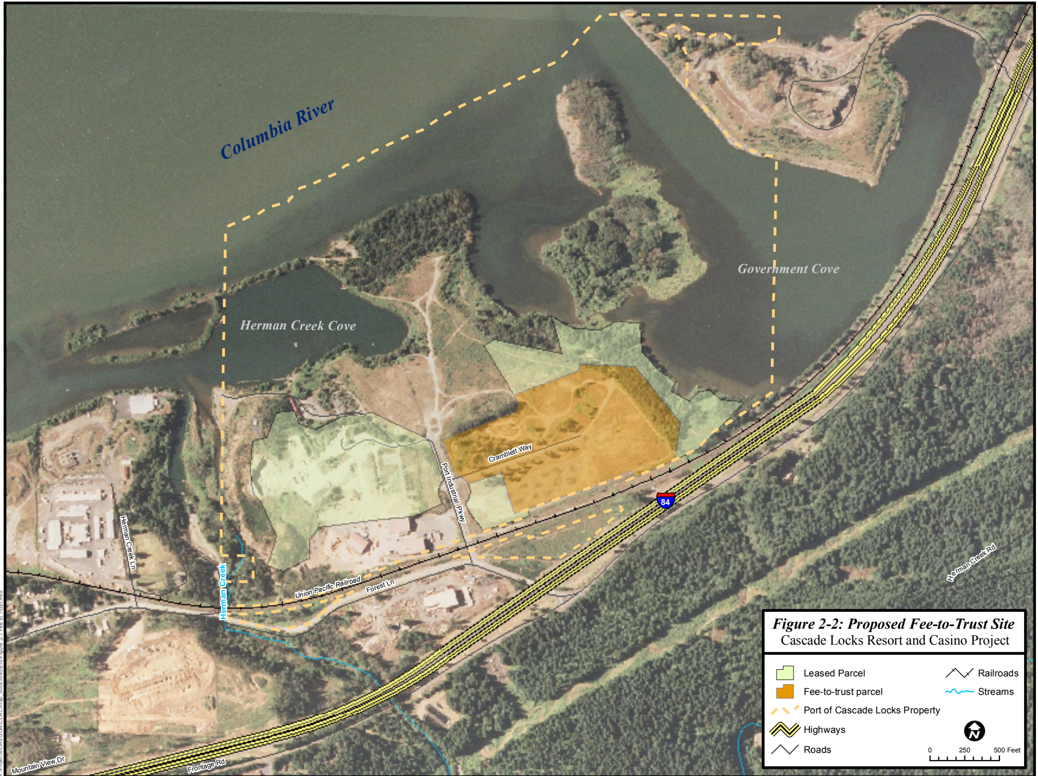
Figure 2-2: Proposed Fee-to-Trust Site Cascade Locks Resort and Casino Project